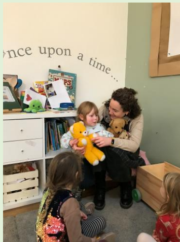
Meeting our most loved teddies.

After half term we will pick a new song from the box. Don't forget to add your favourite in the box.