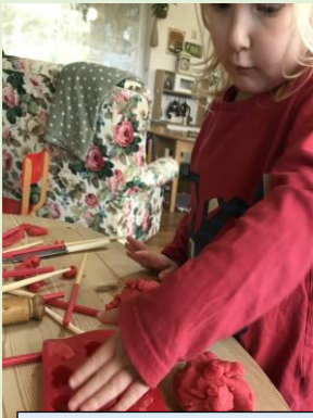
Exploring hearts in the play dough